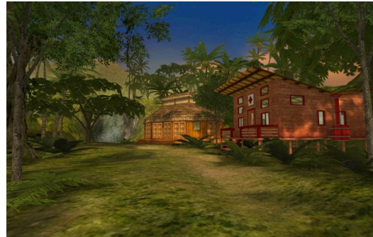
Figure 1. The CRYSTAL ISLAND game-based learning environment.

this paper is the first to investigate dialogue move classification using LSTMs and CRFs that take as input sequential multimodal data streams, which can serve as the foundation for guiding the dialogue of intelligent virtual agents in game-based learning environments.